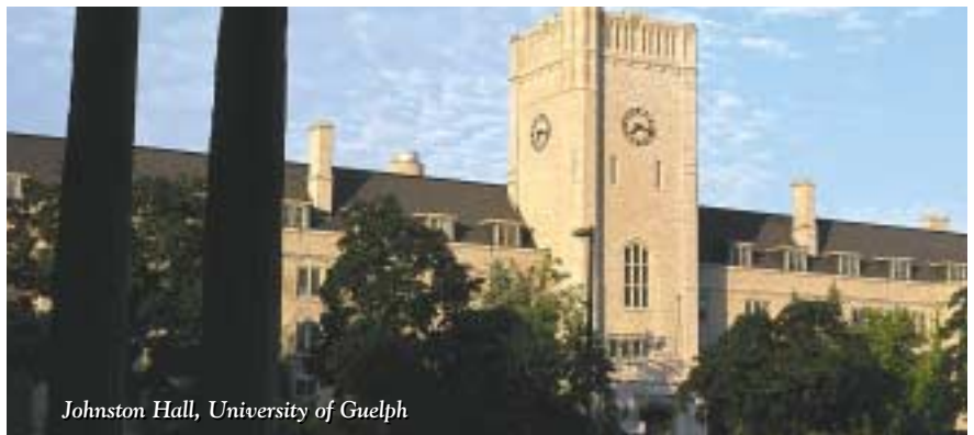
Johnston Hall, University of Guelph

At the centre of Guelph's agri-food and life sciences sectors is a renowned research institution – the University of Guelph. It is recognized internationally for its extensive research program and quality education. It is also a doorway to an international knowledge base for business.